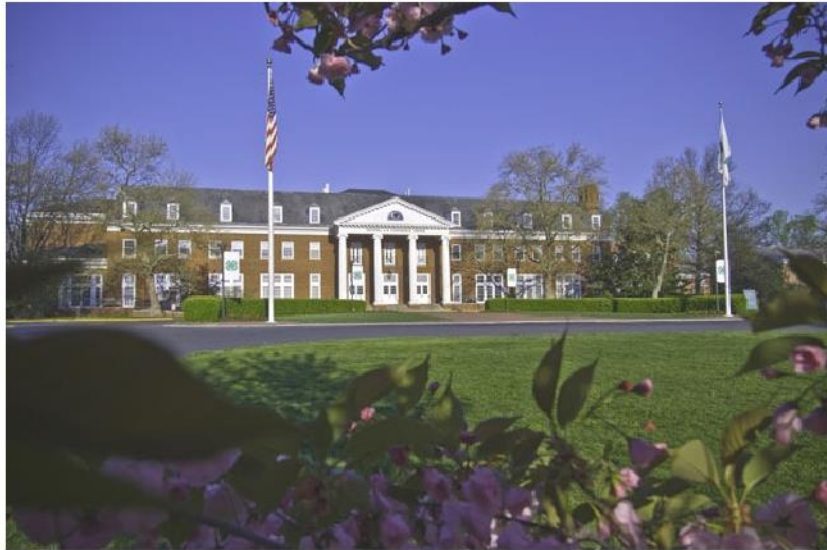
The National 4-H Conference Center Site of the 2020 National Japan Bowl